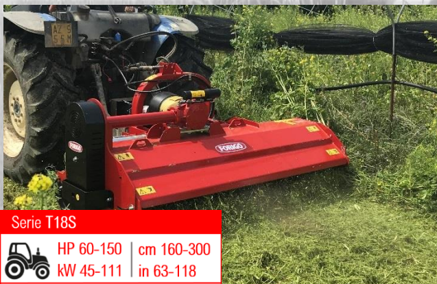
Serie T18S HP 60-150 | cm 160-300 KW 45-111 | in 63-118 Utilizzo Suited for