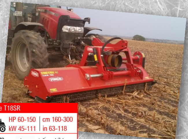
Serie T18SR HP 60-150 | cm 160-300 KW 45-111 | in 63-118 Utilizzo Suited for