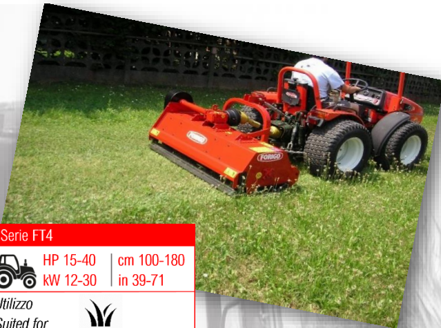
Serie FT4 HP 15-40 | cm 100-180 KW 12-30 | in 39-71 Utilizzo Suited for