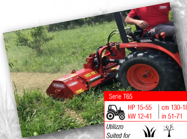
Serie T65 HP 15-55 | cm 130-180 KW 12-41 | in 51-71 Utilizzo Suited for