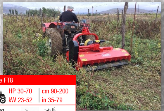
Serie FT8 HP 30-70 | cm 90-200 KW 23-52 | in 35-79 Utilizzo Suited for