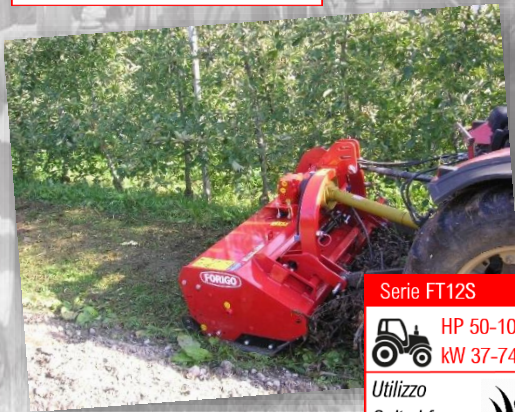
Serie FT12S HP 50-100 | cm 150-280 KW 37-74 | in 59-110 Utilizzo Suited for