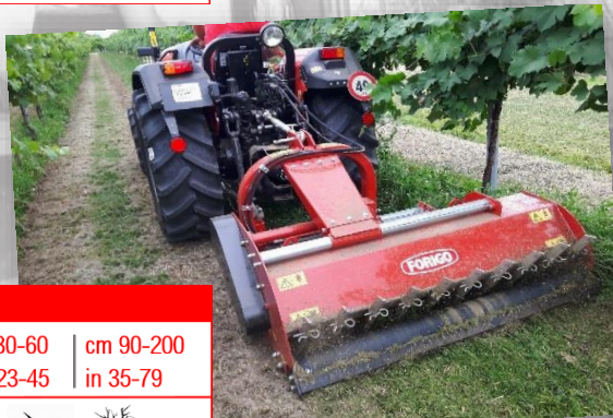
Serie T7 HP 30-60 | cm 90-200 KW 23-45 | in 35-79 Utilizzo Suited for